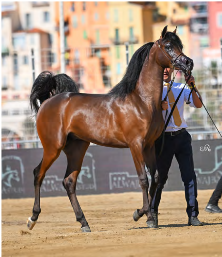
Poker Face KL (x Plivia by Kahil Al Shaqab)