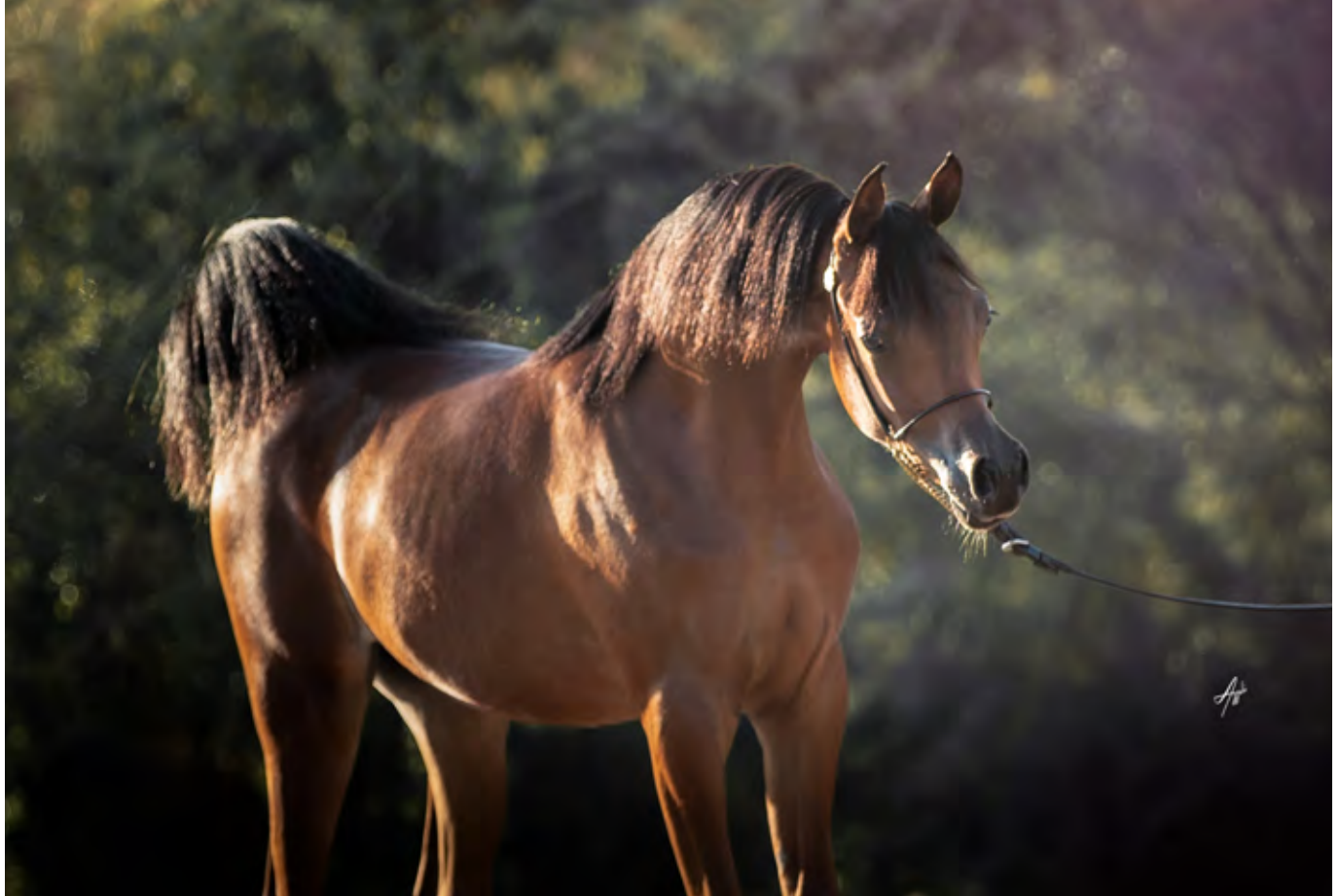
Sheba Al Shaqab (x Empuza by Kahil Al Shaqab)