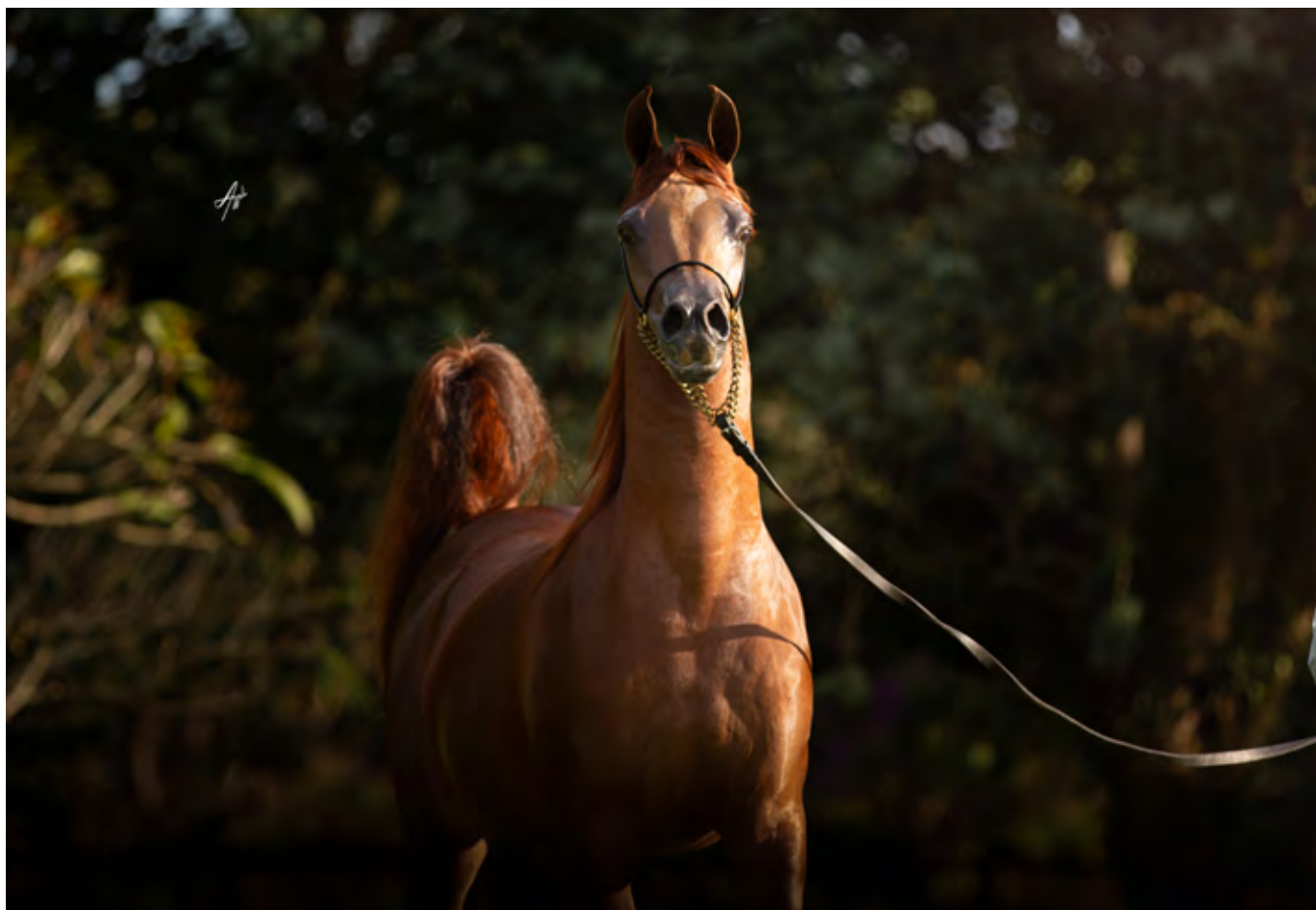
RFI Pavarotti (x Preferida Rach)