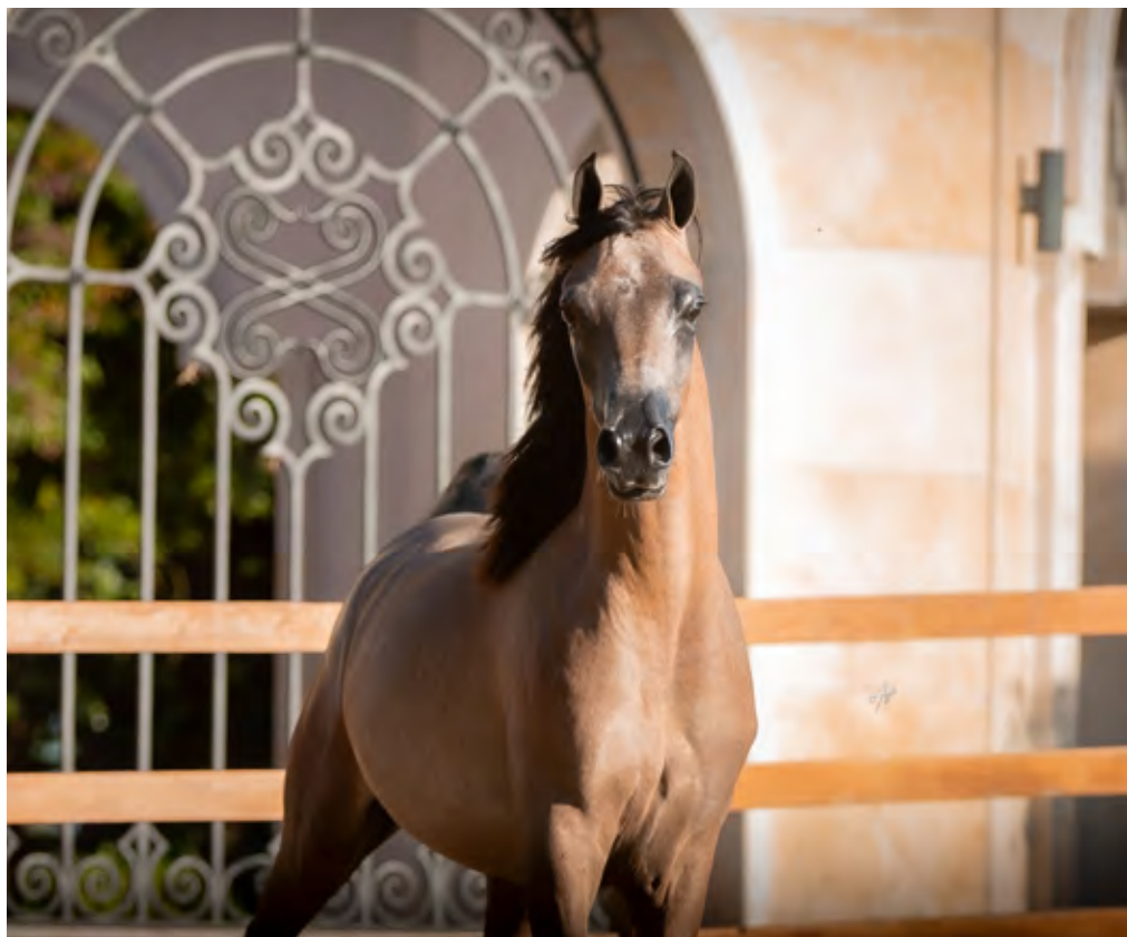
ALK Damara (x Pstarlita by Padron Psyche)

Al Kaiser continues to shine on the global stage with the emergence of a new star, ALK Shama, bred by them and born in Belgium at Jadem Arabians. Born in June 2024 and sired by RFI Unique out of DA Marylin Monroe (by Magic Magnifique), ALK Shama stands out for her extreme beauty and exceptional quality, garnering significant attention. This promising filly is expected to make her debut soon, further reinforcing Al Kaiser’s reputation for producing world-class horses.