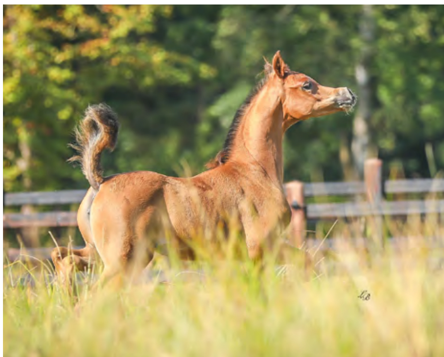
ALK Shama (x DA Marylin Monroe by Magic Magnifique)