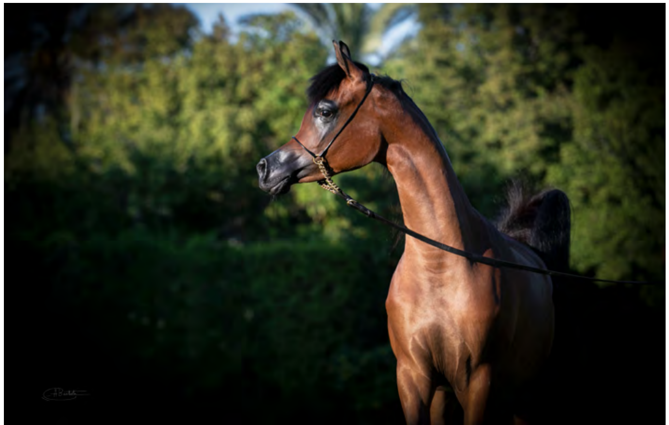
Karma Al Shiraa (x Eralda by Emerald J)