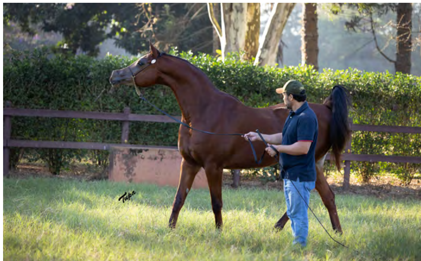
RFI Ultraa AlMaktub (RFI Maktub x Seduction HBV)

First and foremost, it's essential to understand how RFI Unique is contributing to the breeding programs of his owners.