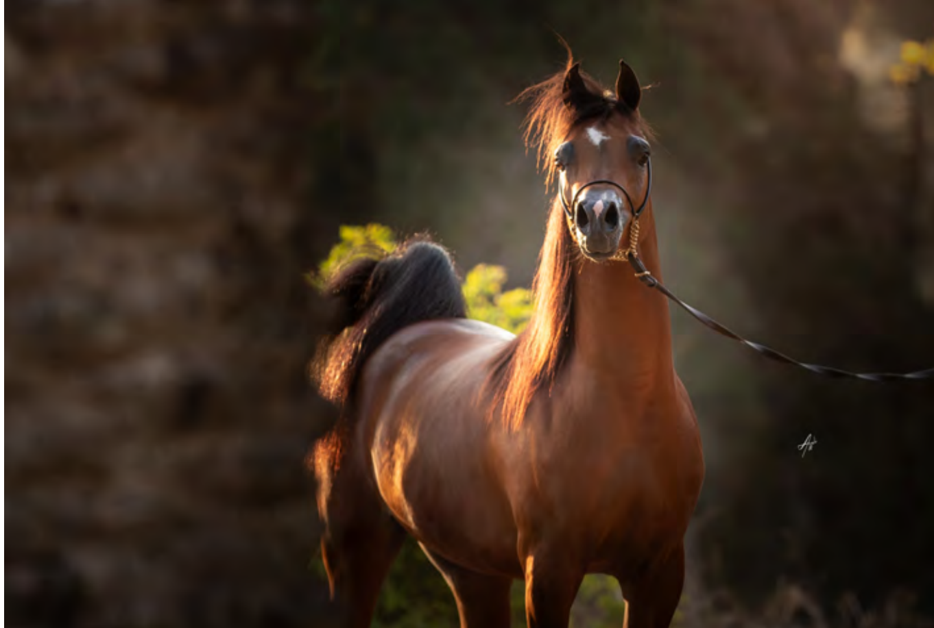
LR Anselmo (x LL Almudena by Bey Shahdow TGS)