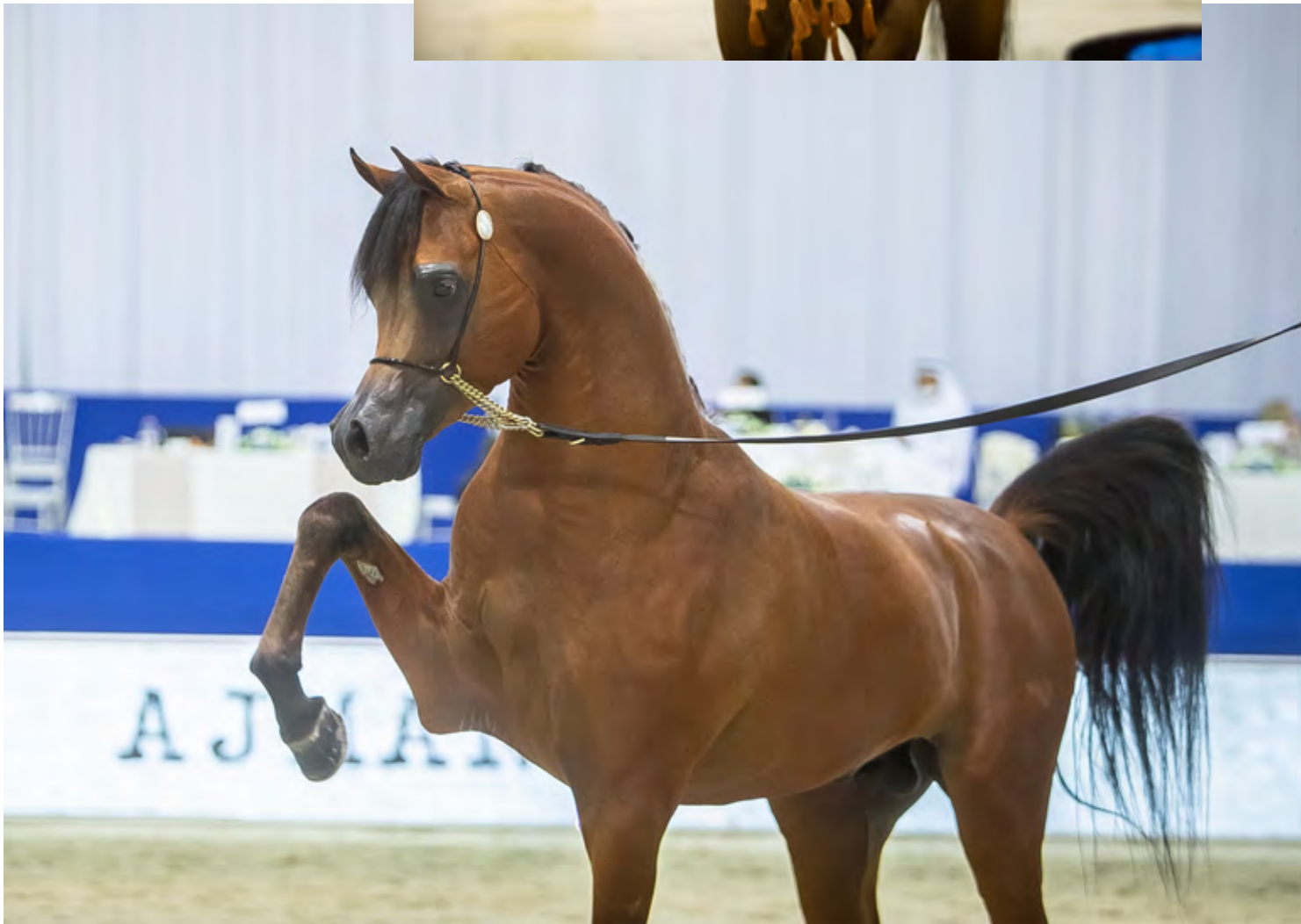
RFI Unique - Bronze Champion Junior Colts at Dubai International AHC 2021