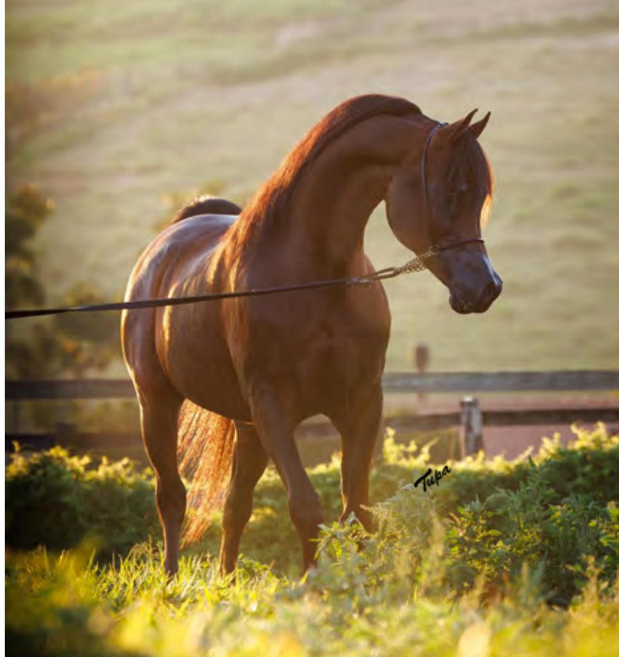
AF Maden (FA El Shawan x AF Odessa)