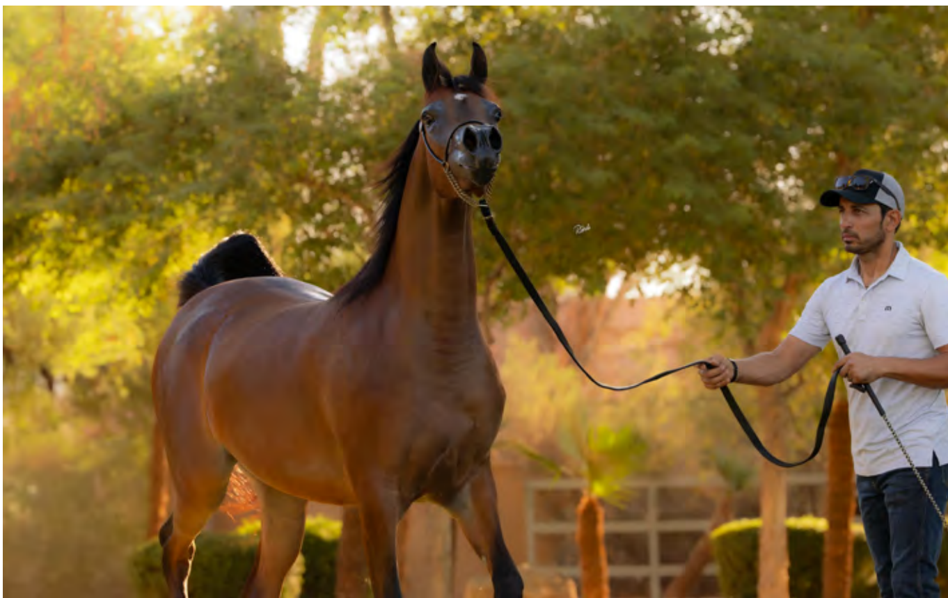
Queen Unique HEO (x LR Atala by Dominic M)