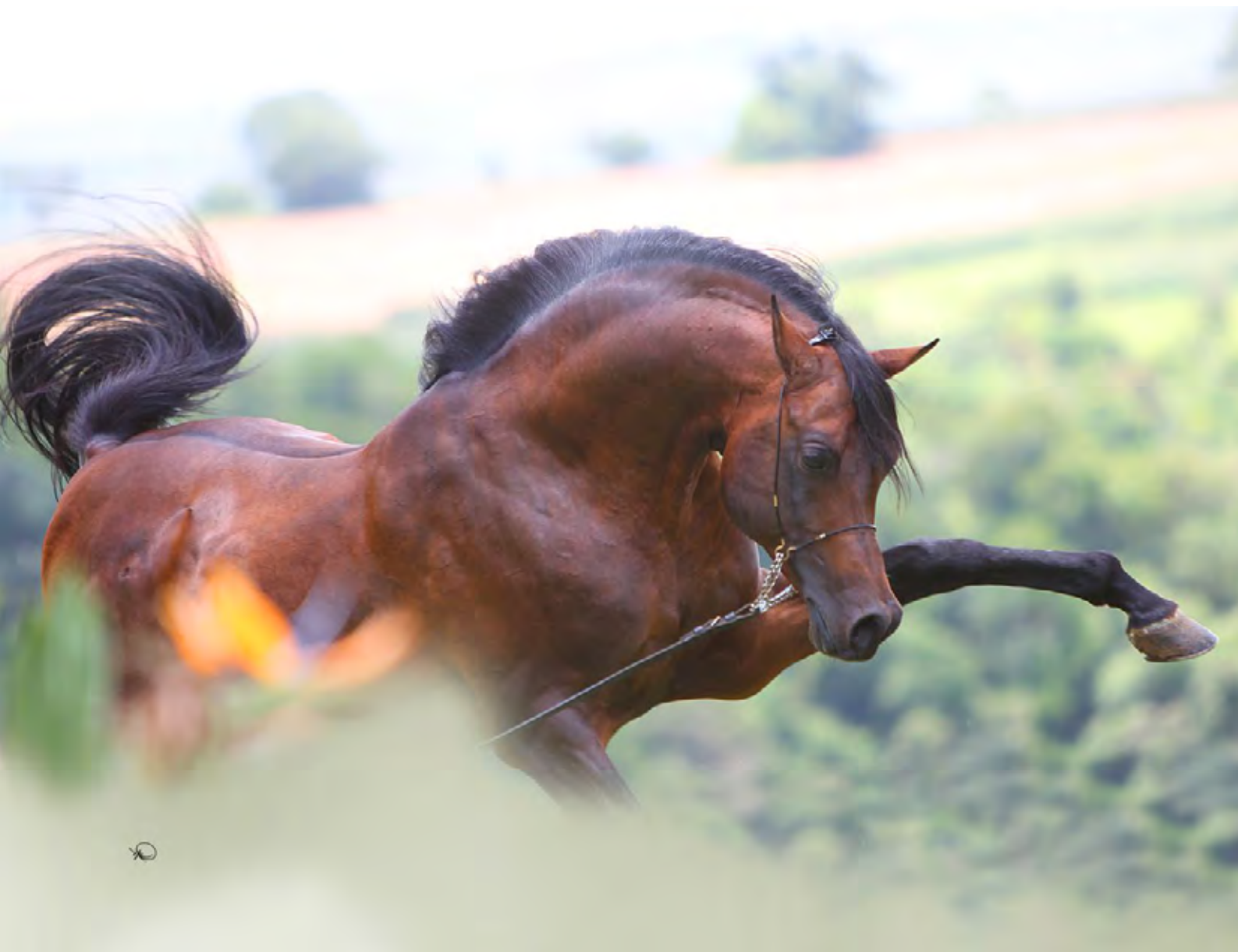
RFI Maktub (Altam x Yshmayl x RFI Cyntilation)