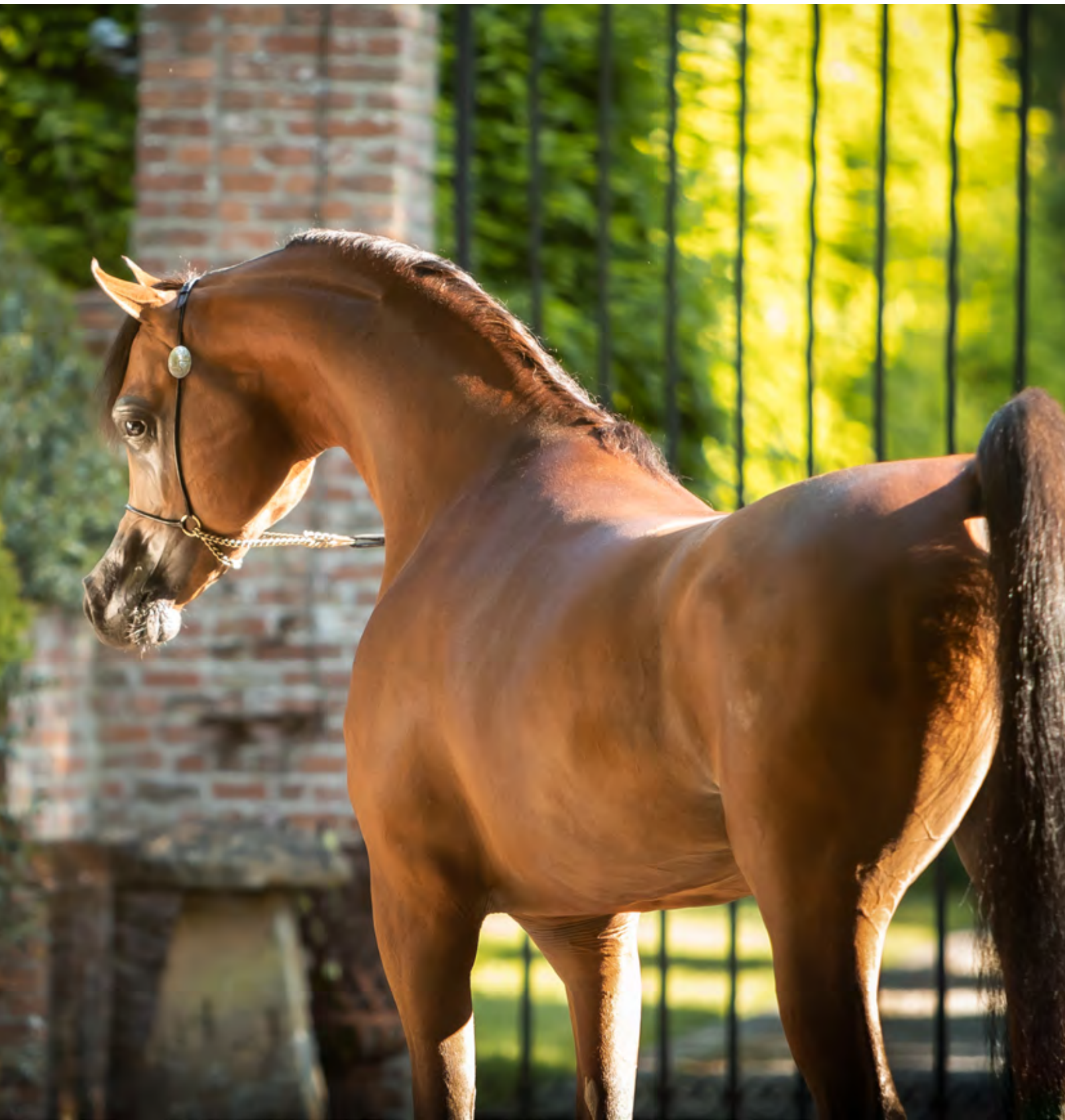
RFI Unique (AF Maden x RFI Ultraa AlMaktub)