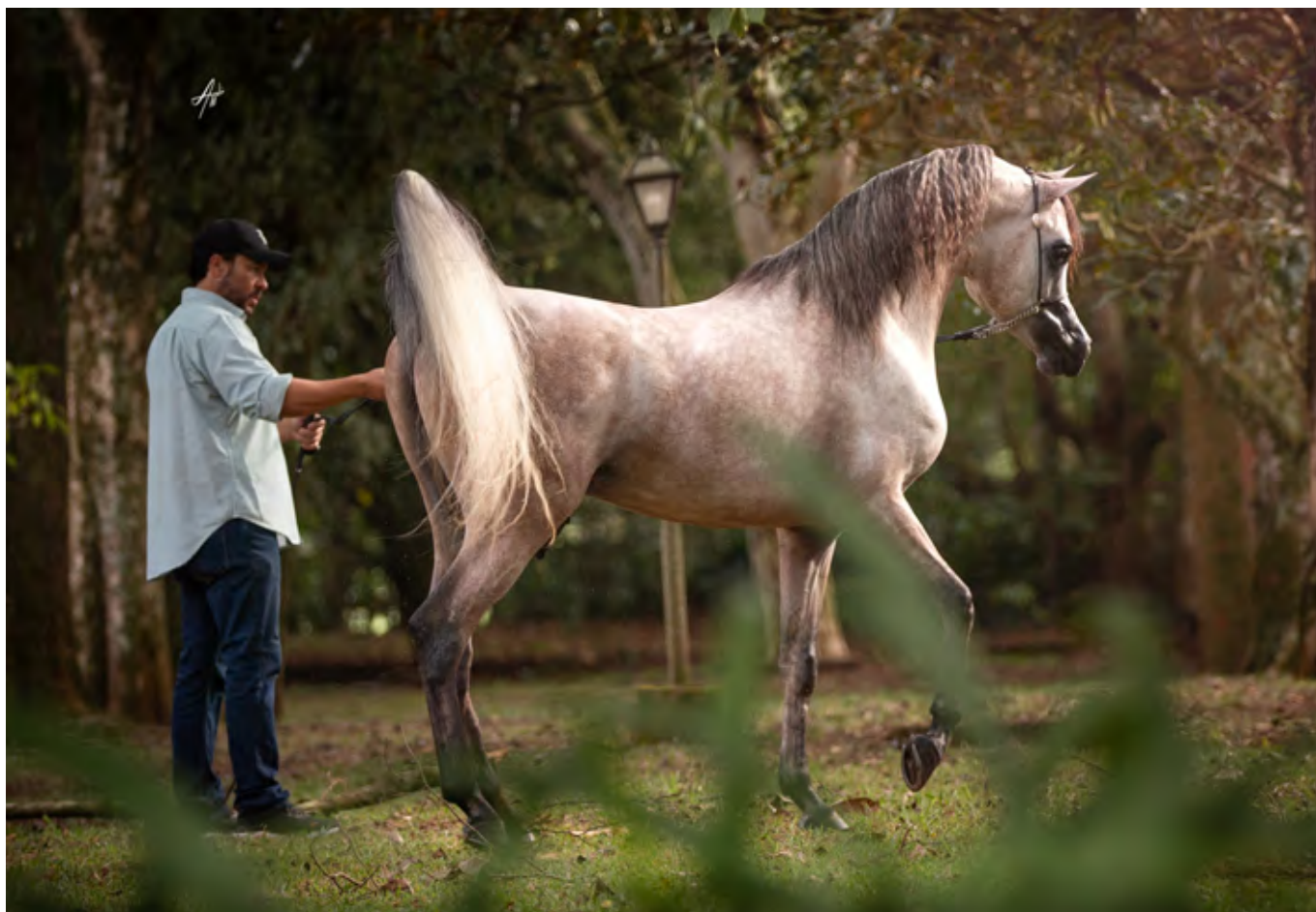
RFI Sharam (x RFI Sawari by Excalibur EA)

delivering impressive results. Both stallions possess a remarkable ability to pass on great beauty and quality to their offspring. RFI Unique, in particular, stands out for producing highly refined, tall, elegant horses with unmatched charisma and movement. This allows the farm to continue producing high-quality, differentiated horses, maintaining the standard for which RFI Arabians is widely recognized. This consistency is also observed in his progeny across various breeding programs worldwide.