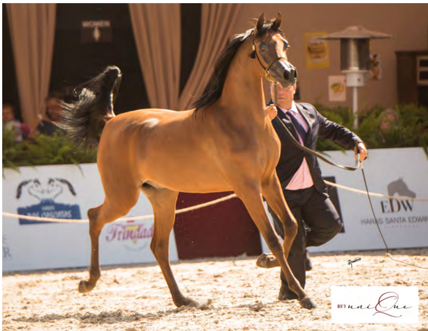
RFI Unique - Gold Champion Young Colts at Brazilian Arabian Horse Nationals 2019