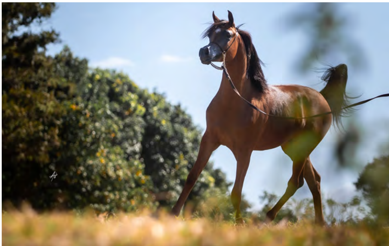
VV Abilah (x Karenina El Madan by El Tino)