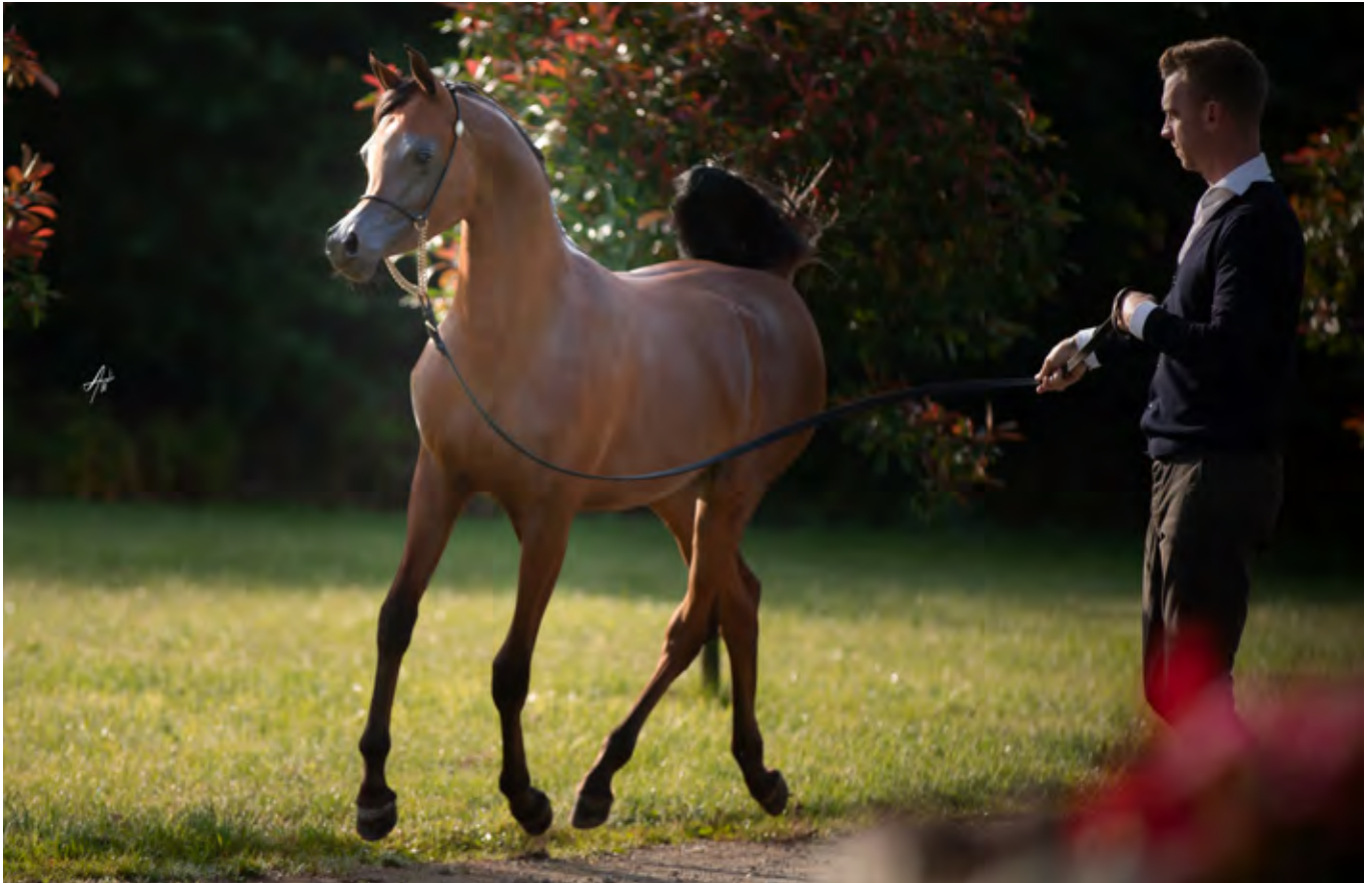
Sahara NWA (x Alexandria NWA by FA El Rasheem)