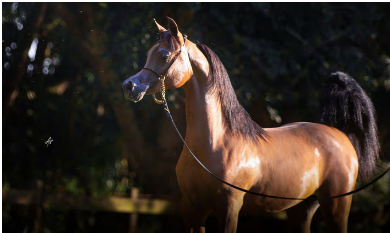
RFI Nadim (x Nahla El Madan by El Tino)