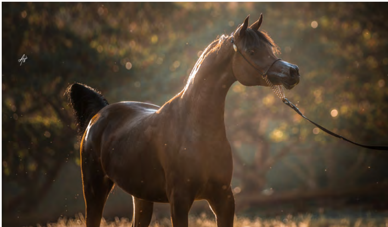
RFI Elena (x RFI Elisha by Quasim CRH)