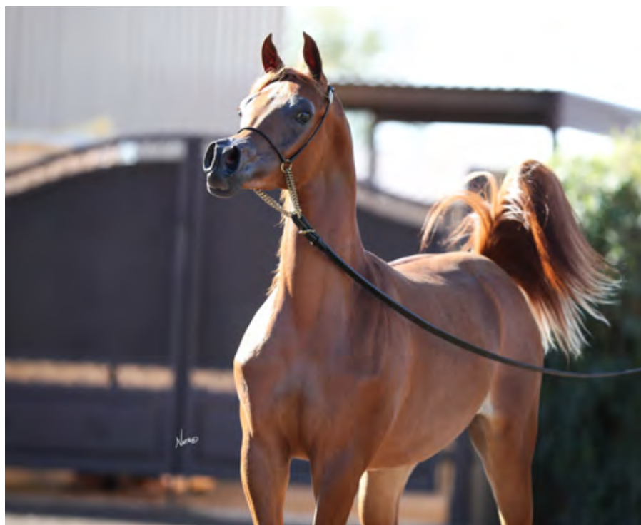
RD Bacaro (x RD Marciea Bay)

set to influence future generations. With an impressive pedigree and a growing roster of champions, RFI Unique is not just a standout sire but a beacon of excellence in the global Arabian horse community. His journey is far from over, and the future looks bright for this exceptional stallion and his ever-expanding lineage. ■